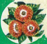
POHUTUKAWA NEW ZEALAND