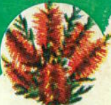
RED BOTTLE BRUSH QUEENSLAND