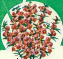
PINK HEATH VICTORIA