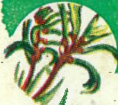
KANGAROO PAW WESTERN AUSTRALIA