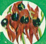
STURT PEA SOUTH AUSTRALIA