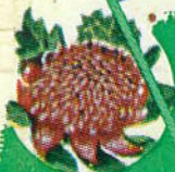
WARATAH NEW SOUTH WALES