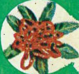
TASMANIAN WARATAH TASMANIA