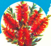
RED BOTTLE BRUSH QUEENSLAND