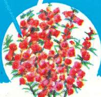
PINK HEATH VICTORIA