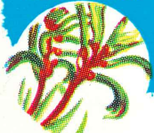
KANGAROO PAW WESTERN AUSTRALIA