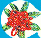
TASMANIAN WARATAH TASMANIA