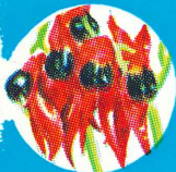
STURT PEA SOUTH AUSTRALIA