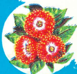
POHUTUKAWA NEW ZEALAND