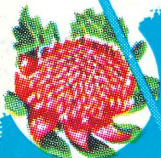
WARATAH NEW SOUTH WALES