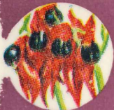
STURT PEA SOUTH AUSTRALIA