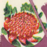
WARATAH NEW SOUTH WALES