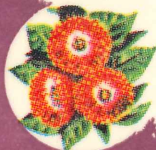
POHUTUKAWA NEW ZEALAND