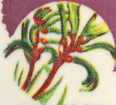
KANGAROO PAW WESTERN AUSTRALIA