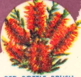
RED BOTTLE BRUSH QUEENSLAND