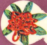
TASMANIAN WARATAH TASMANIA