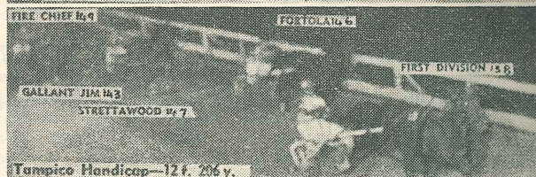
Tampico Handicap—12 f. 206 y.