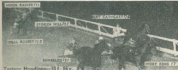
Tortosa Handicap—10 f. 84 y.

Wayville Showgrounds Saturday, 22nd February, 1958