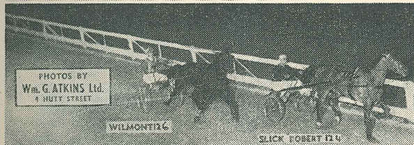
Memphis Handicap—10 f. 84 y.