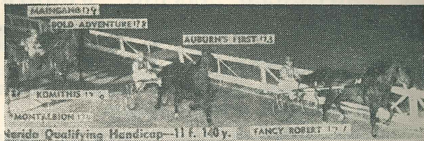
Verde Qualifying Handicap—11 f. 140 y.