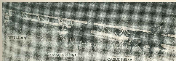
Luzon Free-for-all—11 f. 140 y.