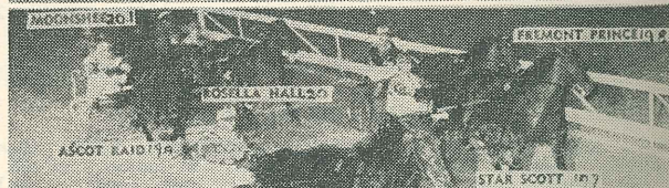
SA Pacina Derby—11 f. 140 y. (2nd heat)