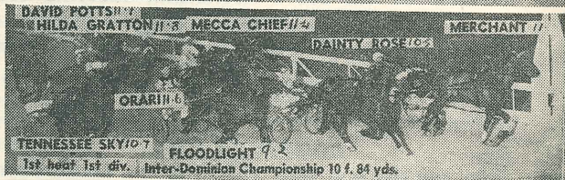
1st heat 1st div. Inter-Dominion Championship 10 f. 84 yds.