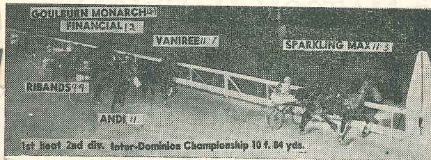
1st heat 2nd div. Inter-Dominion Championship 10 f. 84 yds.