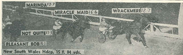
New South Wales Hdcp. 15 f. 84 yds.