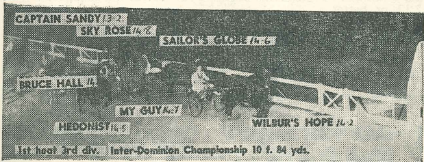
1st heat 3rd div. Inter-Dominion Championship 10 f. 84 yds.