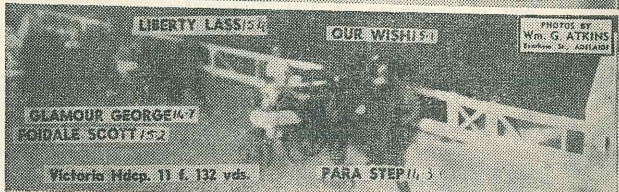
Victoria Hdcp. 11 f. 132 yds.