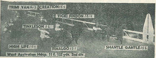
West Australian Hdcp. 11 f. 132 yds. 2nd div.