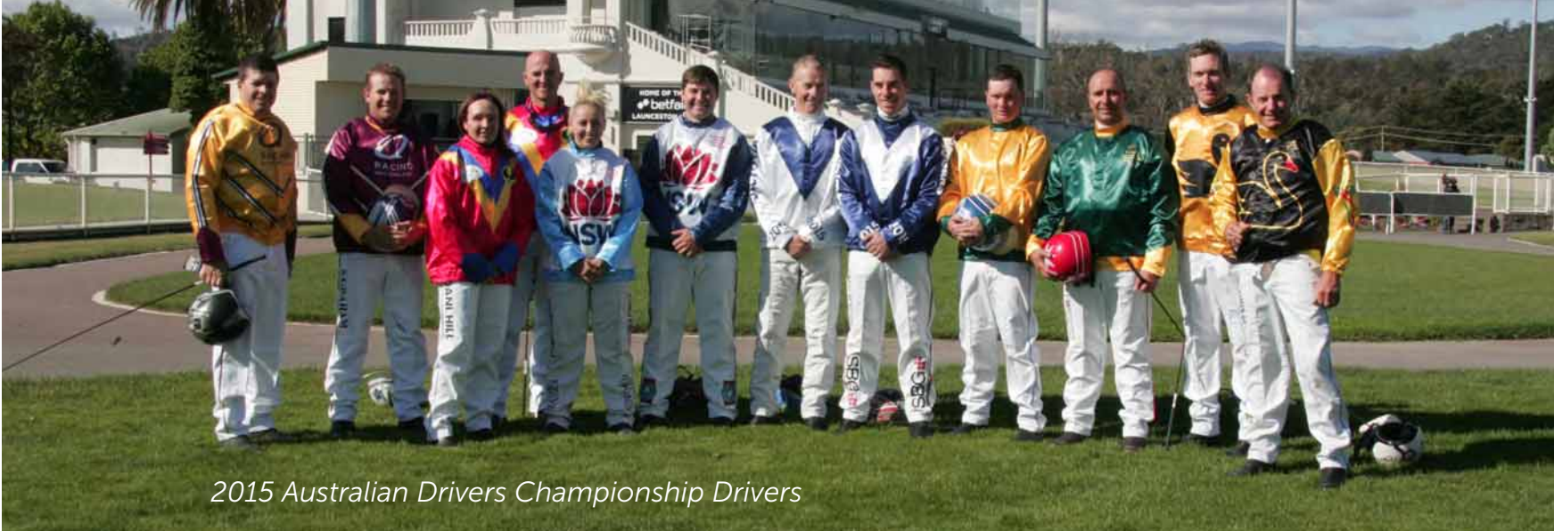
2015 Australian Drivers Championship Drivers