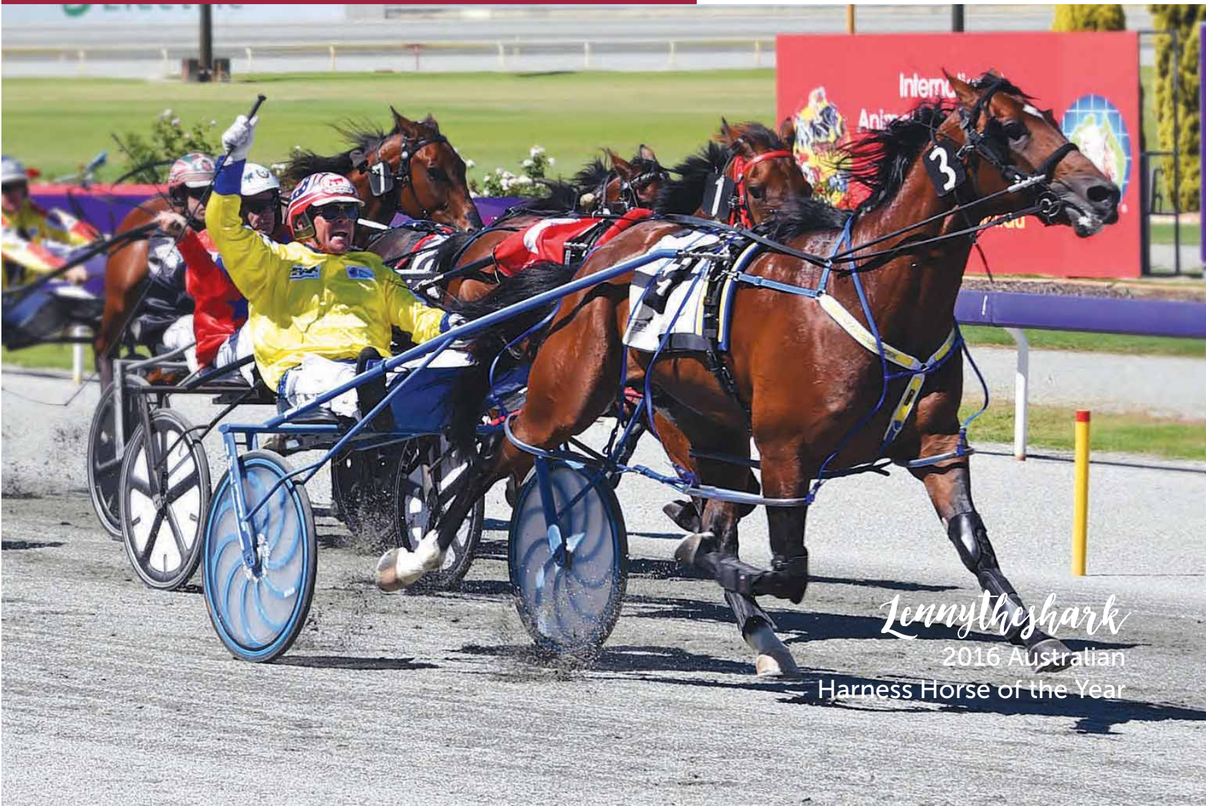
Lennytheshark 2016 Australian Harness Horse of the Year

In Harness Racing circles the 2015/16 season was the "Year of the Shark".